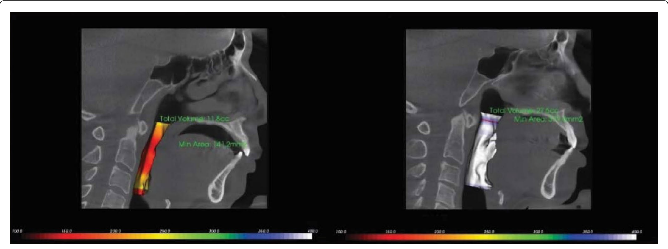
Figure 6: Mid-sagittal slices from a 3D cone-beam computerize axial scan, showing the upper airway changes using the same combined maxillo-mandibular protocol. Note that the upper volume has increased from 11.8cm3 pre-treatment to 27.5cm3 post-treatment, while the minimum cross-sectional area has increased from 141.2cm2 to 379.8cm2 post-treatment, using the combined maxillo-mandibular protocol.