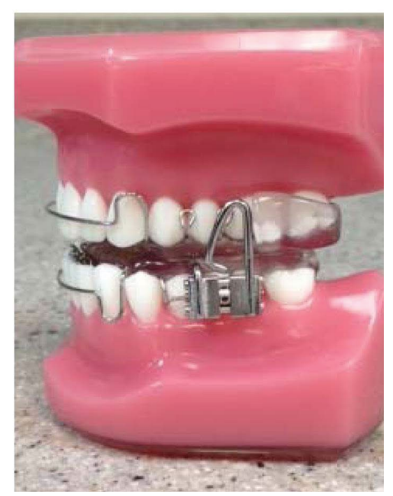
Figure 1: The biomimetic oral appliance (mandibular-Repositioning Nighttime Appliance: mRNA appliance®) used in this study. The mRNA appliance® is FDA-cleared as a Class II medical device for mild to moderate cases of obstructive sleep apnea. Note that the lower component has a screw-fin mechanism to titrate the mandibular repositioning in 1mm increments.

After obtaining informed consent, we included 19 consecutive adults that had been diagnosed with mild to moderate OSA following an overnight home sleep test (HST). The rights of the subjects were protected by following the Declaration of Helsinki. Inclusion criteria were: subjects aged > 21 yrs; diagnosed without severe