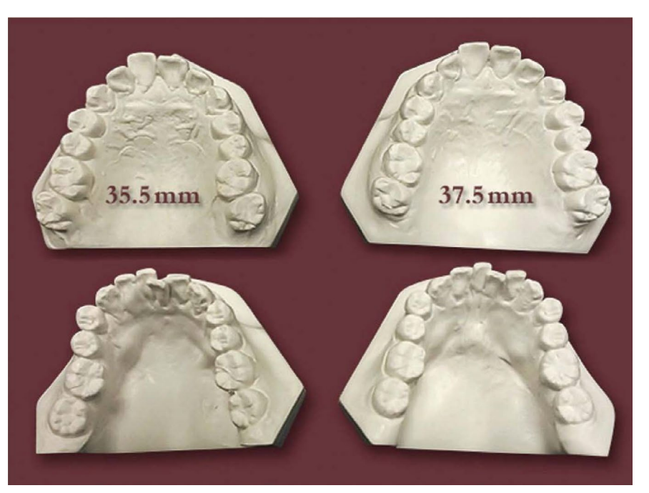
Figure 5: Study models showing the intra-oral changes in a subject who underwent the combined maxillo-mandibular protocol. Note that the minimum inter-molar bone width of the maxilla has increased from 35.5mm to 37.5mm and the arch has become more symmetric and less crowded. Similarly, the mandibular arch shows improved alignment and width simultaneously.

Figure 4 is an example that shows the changes in facial profile and head posture in a subject that participated in this study. Figure 5 is an example that shows study models indicating the intra-oral, maxillo-mandibular changes in a different subject who underwent the same procedure. Figure 6 shows the upper airway changes in another case treated using the same combined maxillo-mandibular protocol.