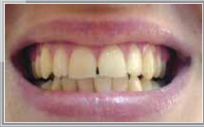
Before (A3 VITA Shade Guide)