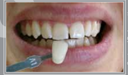
Immediately after (A1 VITA Shade Guide)