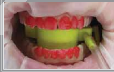
Bleaching gel is applied to the teeth.